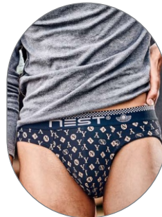
Printed Lycra Brief