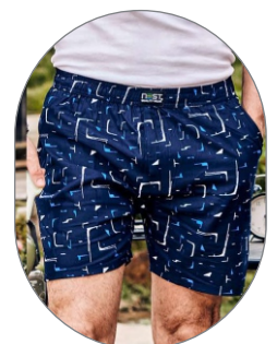
Nest Boxer Multi Color/Prints