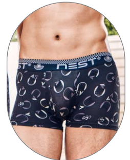
Printed Lycra Trunk