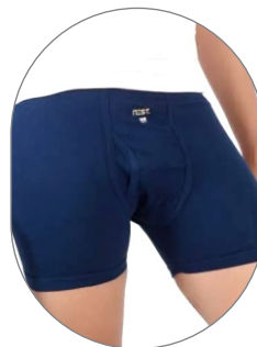
Long Trunk IE