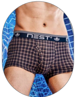
Checks Lycra Trunk