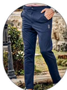
Pant Style Lycra track