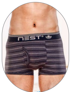
Stripped Lycra Trunk