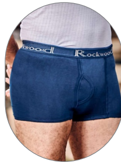
Mini Trunk OE