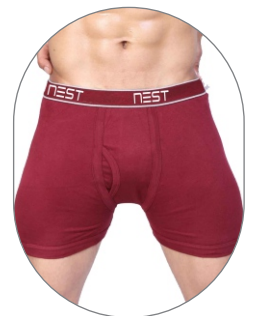
Long Trunk OE