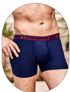
Long Trunk OE