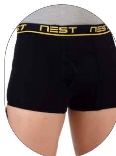
Mini Trunk OE