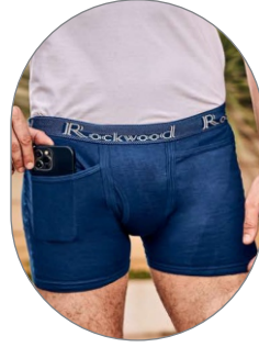
ICD Trunk Outer Pocket