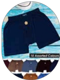
Long Trunk IE