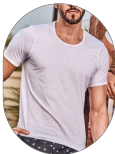
Nest Reliance Light Vest