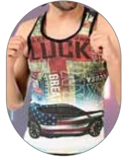
Full Print GYM Vest