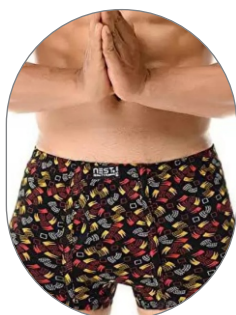
Printed Mini Trunk Inner