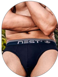
Plain Model Lycra Brief